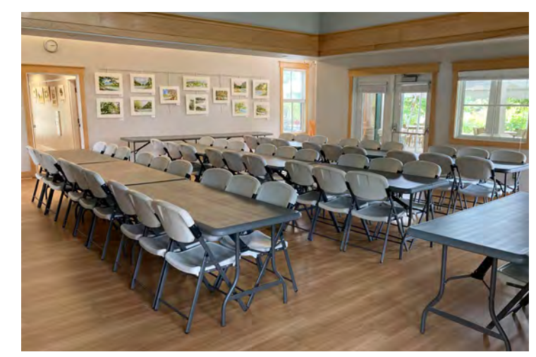
Cafeteria Style for up to 54 people (6 per table)