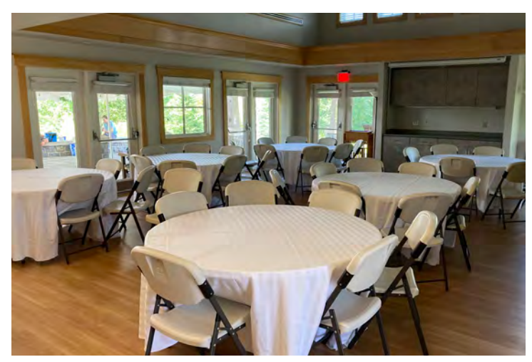
Rounds - Up to six 5' Diameter Round Tables for up to 48 people (8 per table)