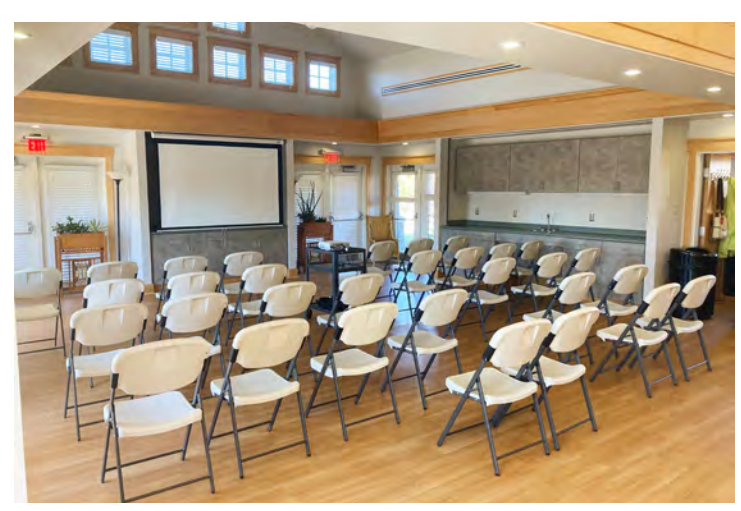
Classroom Seating for up to 50 people